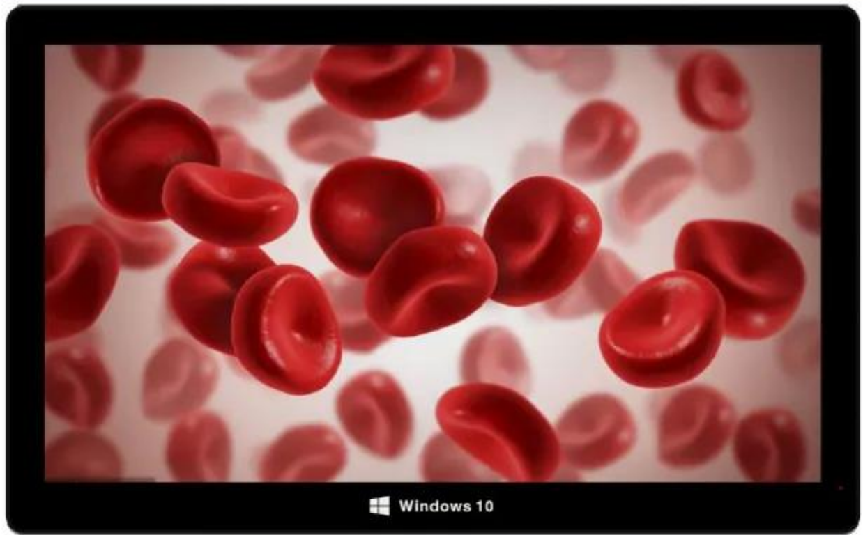
11.6" LCD, Resolution 1920x1080p IPS Touch Screen Win10 Tablet