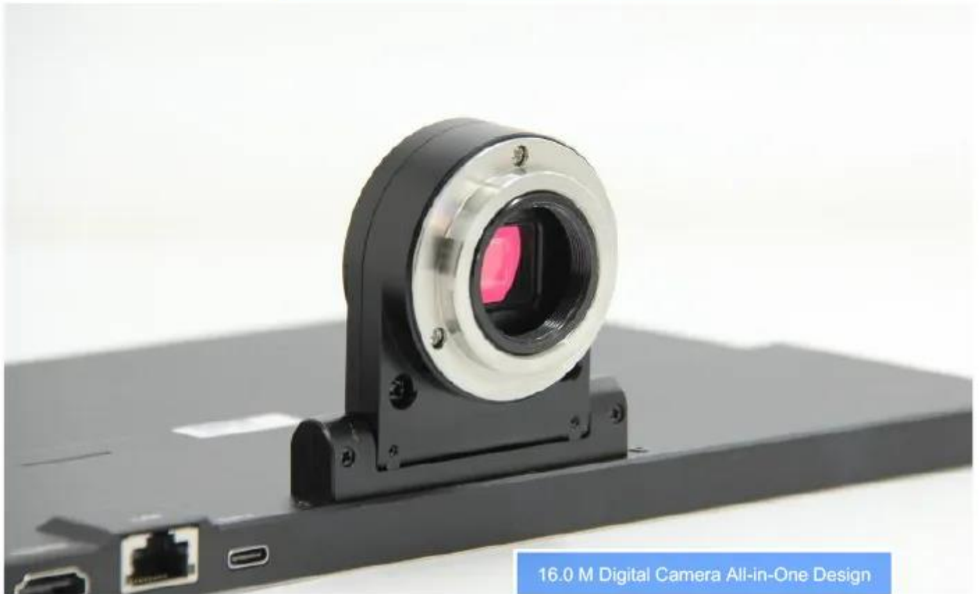
16.0 M Digital Camera All-in-One Design